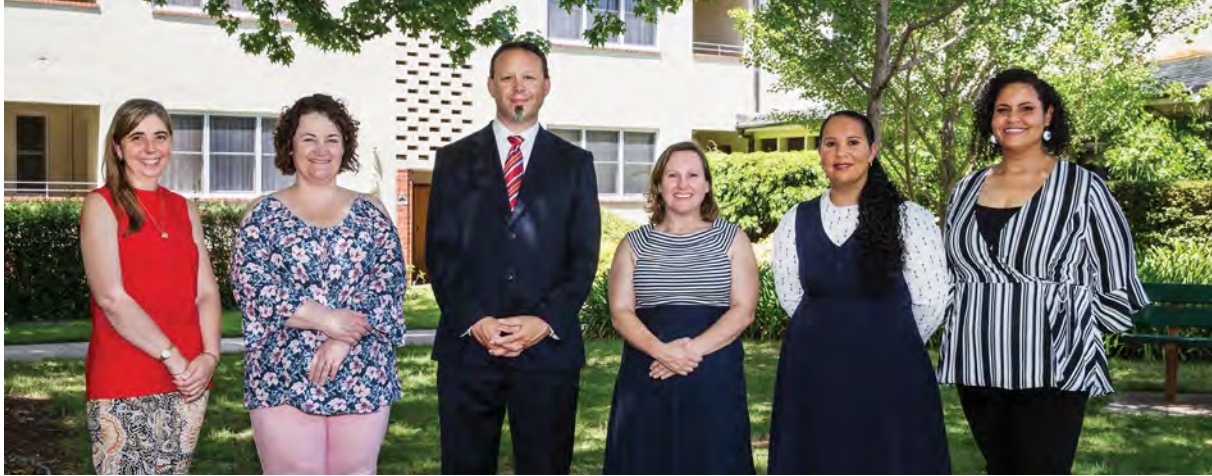
2020 Sir Roland Wilson Pat Turner scholars